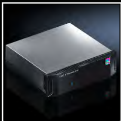
► CMC Remote Management & Monitoring