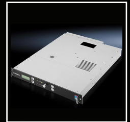
► DET-AC Fire Alarm/Extinguisher System

More accessories: www.rittal.ca/datasolutions