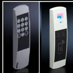
► Security Access