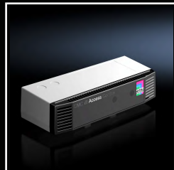
► Environmental Monitoring